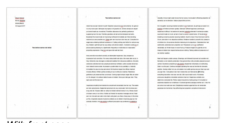
With front page

Pictures: Pictures should be used only where appropriate, where they add to the text, help it along, and illustrate a point. Pictures should never be used as an adornment or to make, say, a front page look "good".